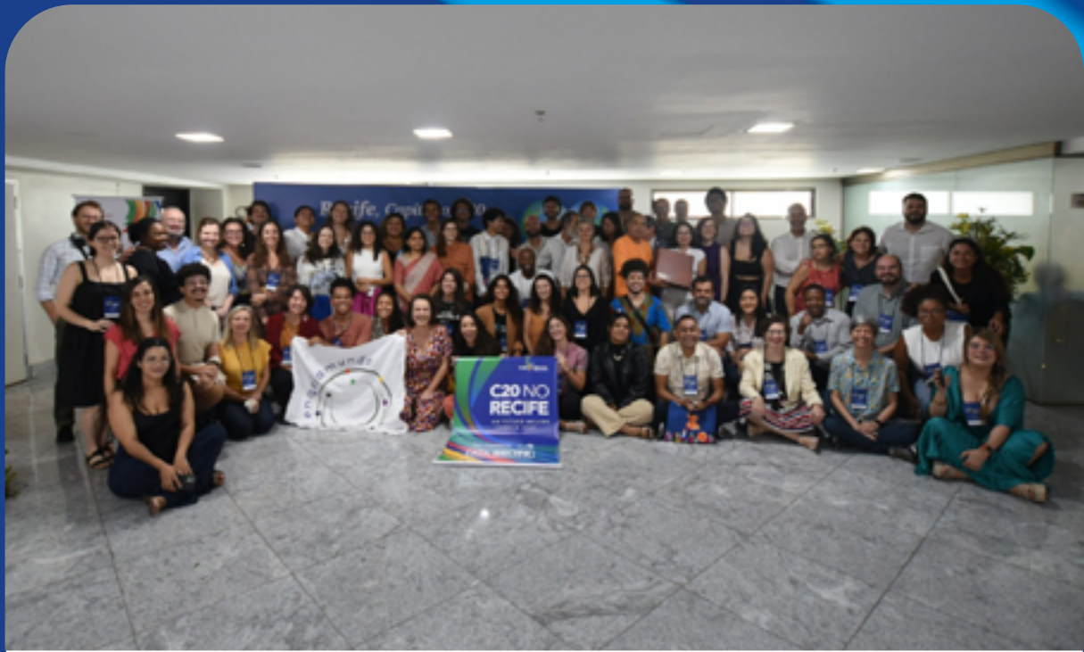
Inception Meeting (24 - 26 March, 2024 in Recife)