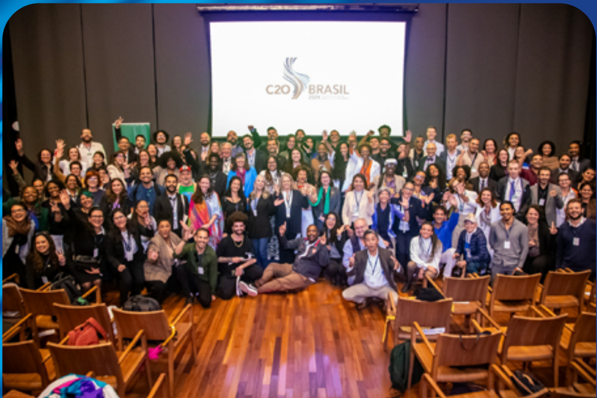
Midterm Meeting (01-02 July, 2024 in Rio de Janeiro)